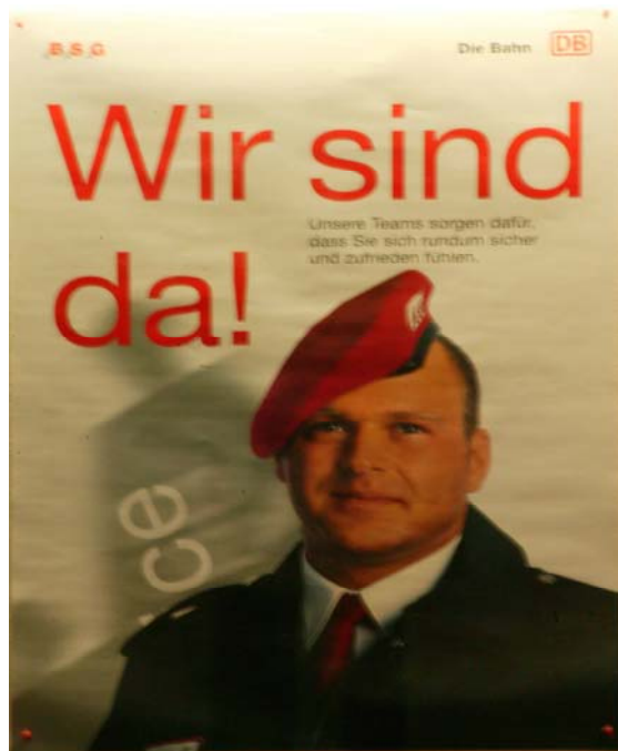
The S-Bahn Police "Wir sind da!" = We are here!

Well, fare cards are reviewed by the S-Bahn police and these people have holstered 9 mm H&K semi-automatic pistols. Now, given German society's conformity, the uniforms would seem to be sufficient to frighten anyone. But, no, there's the gun holstered on a web belt. One look tells me do not make any furtive movements! Oh, one more thing, their uniforms are olive green with all the unit and rank patches topped with a stylish red beret.